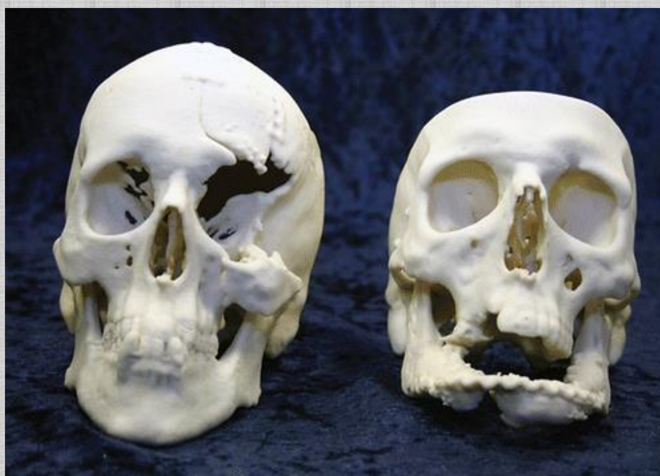
Figure 2: Two 3-D printed models of patients with facial trauma. 6